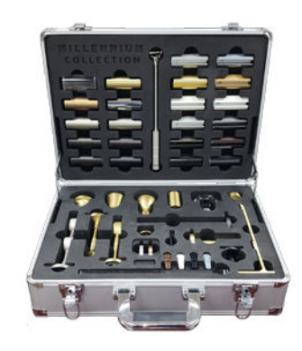
Millennium Collection Sample Case